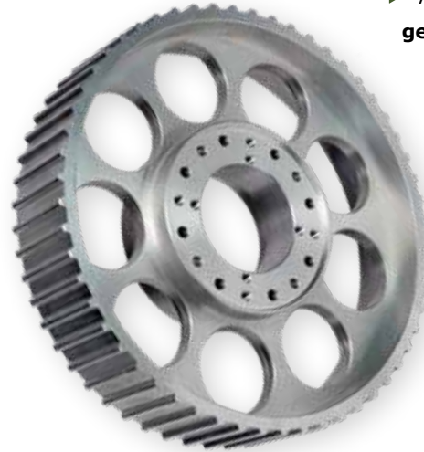
► Aluminium gear wheel